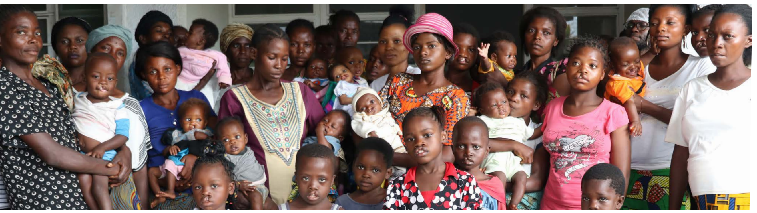
Hopital General Dipumba, DR Congo

Often, people affected by clefts are unable to weigh in on the policies that most affect their lives. Smile Train makes their voices heard. Our representatives put cleft awareness on the global agenda, including advocating at the World Health Assembly and the UN General Assembly. Our regional staff members forge relationships with local governments and partners to advance the rights of people with clefts — especially the right to safe, quality healthcare that makes so many other rights possible, like education and economic independence.